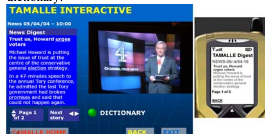
Figure 5: Scaffolding overall understanding

This is augmented by an on-screen dictionary. In the following screenshot, a news digest is provided on the left hand side of TAMALLE iTV application, activated by the green button on the remote control. The mobile phone version also provides a link to a programme summary that can be accessible before, during or after the show and on move. Again this is augmented by a dictionary.