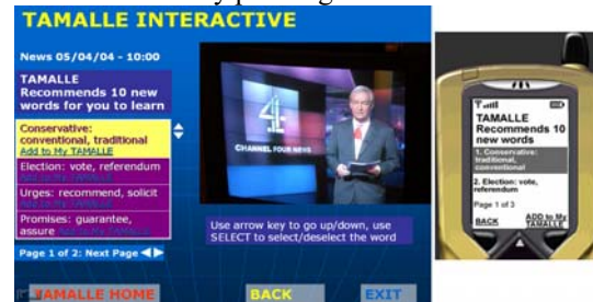
Figure 4: Scaffolding difficult language item

down the list, while the Select key allows adding a chosen word to a learner’s personal sphere. On the mobile interface, a selected word is highlighted and could be added by pressing the handset’s select key.