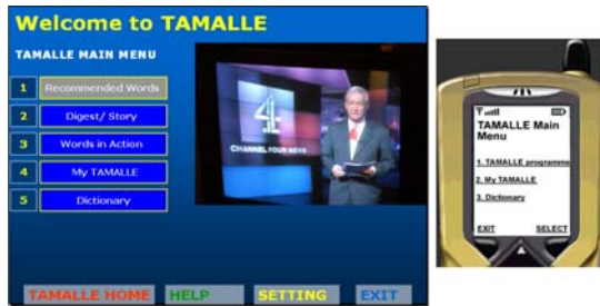
Figure 2: TAMALLE main menu

5.2.1. Just-in-time scaffolding. The system provides just-in-time help for difficult cultural or language items as they appear in the programme. By pressing “Words in Action” from the TAMALLE main menu the just-in-time support will be activated providing textual annotation similar to subtitles on the television screen. The individual items may explicate a word (e.g. Tory = Conservative) or identify a scene or individual (This is 10 Downing St – the Prime Minister’s residence). The reason that our design locates the call-to-action dialogue on the iTV side rather than the phone is due to the fact that this just-in-time scaffolding will be only beneficial during the programme show time and not before and after. However, a mobile can augment just-in-time support while watching with other fellow viewers who may not be interested in learning a language. The learner may not want to impose annotations on everyone in the room. In this case, they can send a text message to service whose number is displayed briefly on the television screen to get just-in-time scaffolding on their mobile phone (see Figure 3).