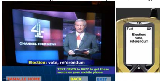
Figure 3: Just-in-time scaffolding

5.2.1. Just-in-time scaffolding. The system provides just-in-time help for difficult cultural or language items as they appear in the programme. By pressing “Words in Action” from the TAMALLE main menu the just-in-time support will be activated providing textual annotation similar to subtitles on the television screen. The individual items may explicate a word (e.g. Tory = Conservative) or identify a scene or individual (This is 10 Downing St – the Prime Minister’s residence). The reason that our design locates the call-to-action dialogue on the iTV side rather than the phone is due to the fact that this just-in-time scaffolding will be only beneficial during the programme show time and not before and after. However, a mobile can augment just-in-time support while watching with other fellow viewers who may not be interested in learning a language. The learner may not want to impose annotations on everyone in the room. In this case, they can send a text message to service whose number is displayed briefly on the television screen to get just-in-time scaffolding on their mobile phone (see Figure 3).